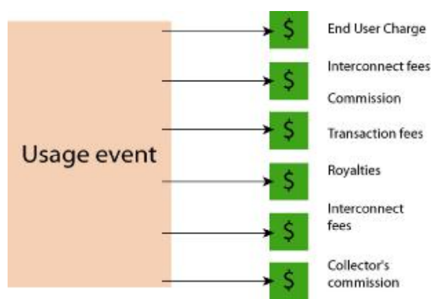
Figure 3. Generation of billing records to support value chain